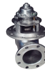
Sening™ Truck Fittings