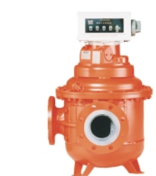
Smith Meter™ ASF-4-NF Aviation Meter