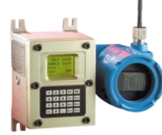
Smith Meter™ microLoad.net