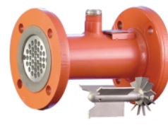
Smith Meter™ Turbine Meter