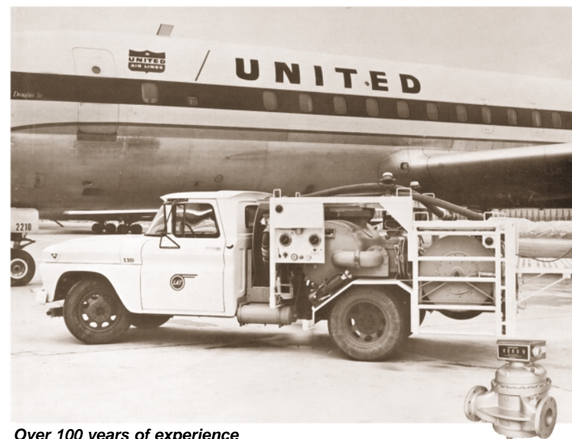
Over 100 years of experience

Now, the best is even better. We've teamed up Sening™ and Smith Meter™ with LTS Sales to offer a broad range of products with expanded services to our customers. Together we have the ability to accommodate complete aviation fueling systems. The synergy, collective knowledge and experience of these well respected brands provide superior products and systems with improved savings.