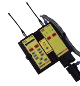
Sening™ MultiControl Deadman/Remote