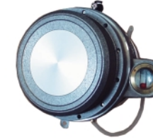
Sening™ API Coupler