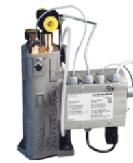
Sening™ Aviation Additive Injector