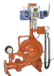
Smith Meter™ PRIME 4 Meter