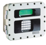
Smith Meter™ AccuLoad III